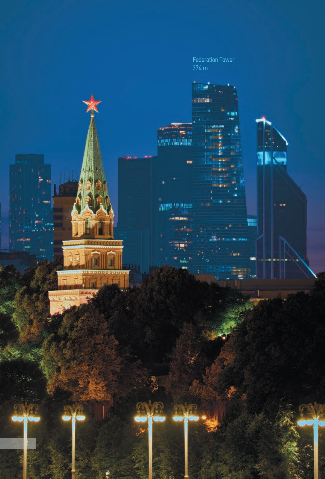
Federation Tower 374 m

The highest peak in Moscow. The highest peak in the country. The highest peak in Europe.